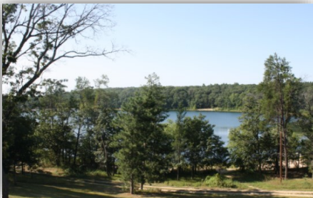
Pine Lake Camp