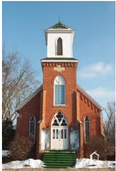
Wilmot UMC Wilmot, WI