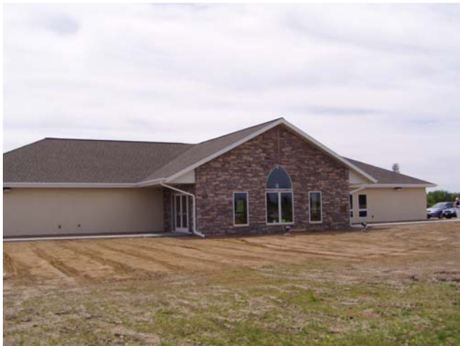
A crisp sunny morning greeted the congregation on Easter Sunday as they worshipped in their new church home for the first time.