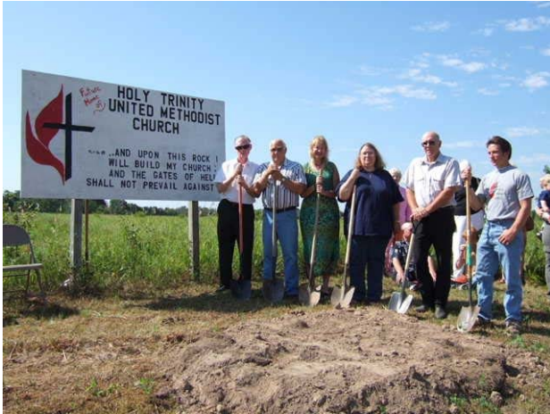
Groundbreaking ceremony, summer 2005