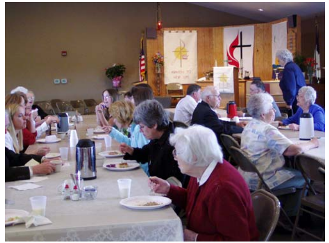
A celebration meal followed the Consecration Service, May, 2006.

This journey began in 2000 when Holy Trinity UMC in Balsam Lake merged with Centuria UMC. A visioning committee was established with an emphasis on serving the larger community. Over the next several years, the Building Committee developed and revised plans to meet their ministry needs. Construction began in the fall of 2005 and includes a multi-use space for worship/fellowship, kitchen, nursery, classrooms, library, office space, restrooms, vestibule, storage and parking. Holy Trinity's building plans also include a Phase 2 project. This phase will add a sanctuary off of the vestibule.