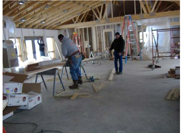
Progress continues indoors during the cold winter months.