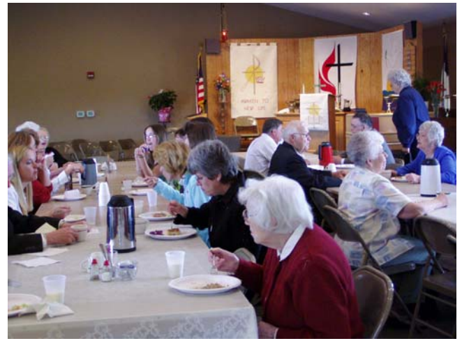
A celebration meal followed the Consecration Service, May, 2006.

This journey began in 2000 when Holy Trinity UMC in Balsam Lake merged with Centuria UMC. A visioning committee was established with an emphasis on serving the larger community. Over the next several years, the Building Committee developed and revised plans to meet their ministry needs. Construction began in the fall of 2005 and includes a multi-use space for worship/fellowship, kitchen, nursery, classrooms, library, office space, restrooms, vestibule, storage and parking. Holy Trinity's building plans also include a Phase 2 project. This phase will add a sanctuary off of the vestibule.